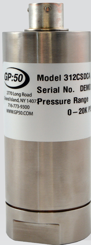
Model 112 / 212 / 312 Ultra High-Pressure Transducer